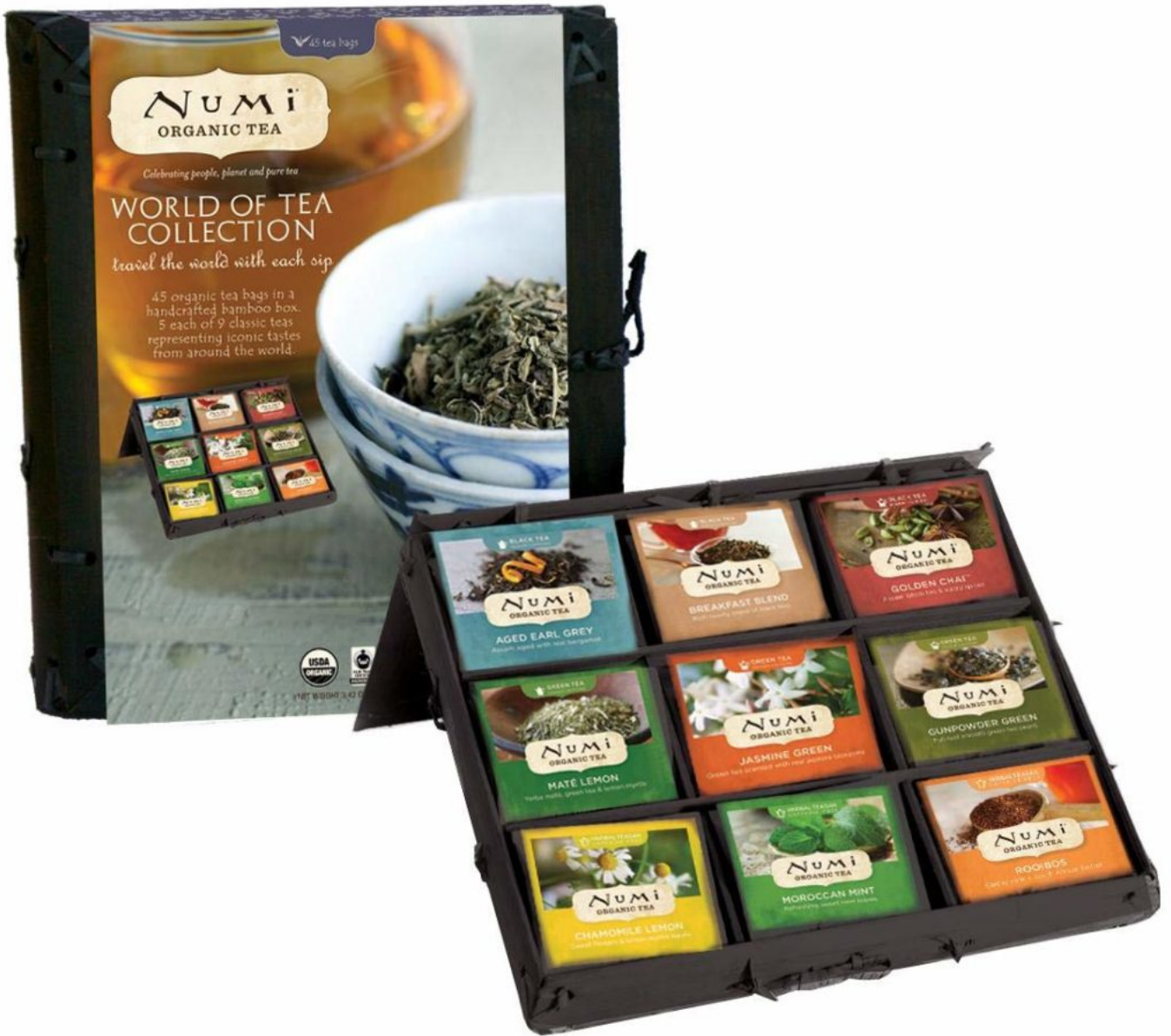
Numi Organic Tea World of Tea