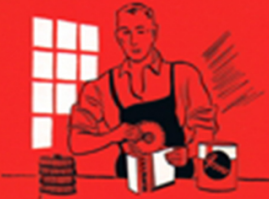
Heavy machine grease, dirt and various stains wash off with lacquer.