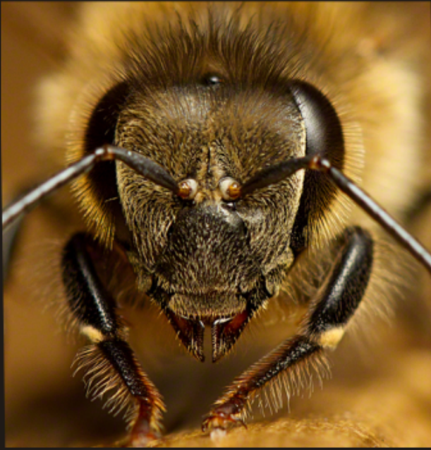
male bee (drone)