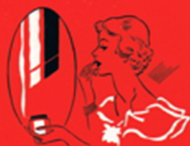
Unlacquered packages and labels retain original attractiveness by lacquer coating.

USE THE COUPON FOR FURTHER INFORMATION OR WRITE TO HERCULES POWDER COMPANY, WILMINGTON, DELAWARE