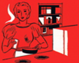
Kitchen grease, soap, butter can be wiped from the surface of lacquered packages.