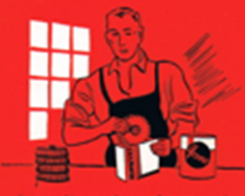
Heavy machine parts do not soil cartons coated inside with lacquer.