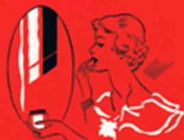
Lacquered packages and labels retain original attractiveness by lacquer coating.

USE THE COUPON FOR FURTHER INFORMATION OR WRITE TO HERCULES POWDER COMPANY, WILMINGTON, DELAWARE