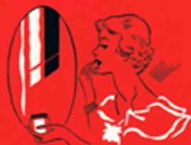
Unlacquered packages and labels retain original attractiveness by lacquer coating.

USE THE COUPON FOR FURTHER INFORMATION OR WRITE TO HERCULES POWDER COMPANY, WILMINGTON, DELAWARE