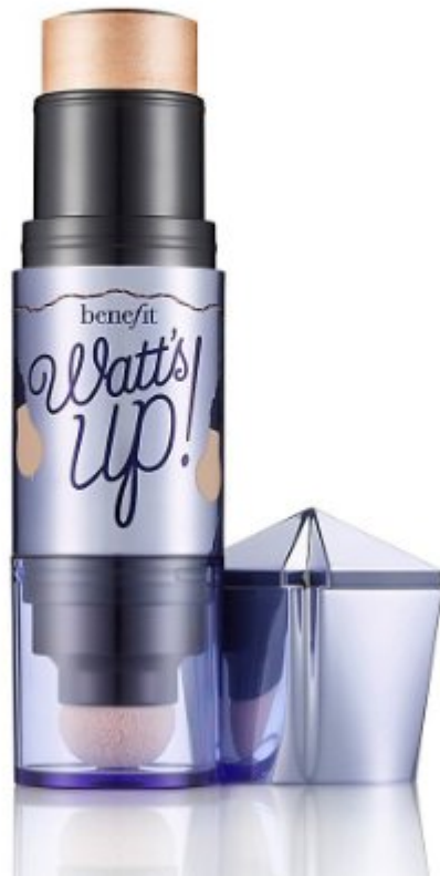
Benefit Cosmetics Watt'S Up! Soft Focus Highlighter for Face