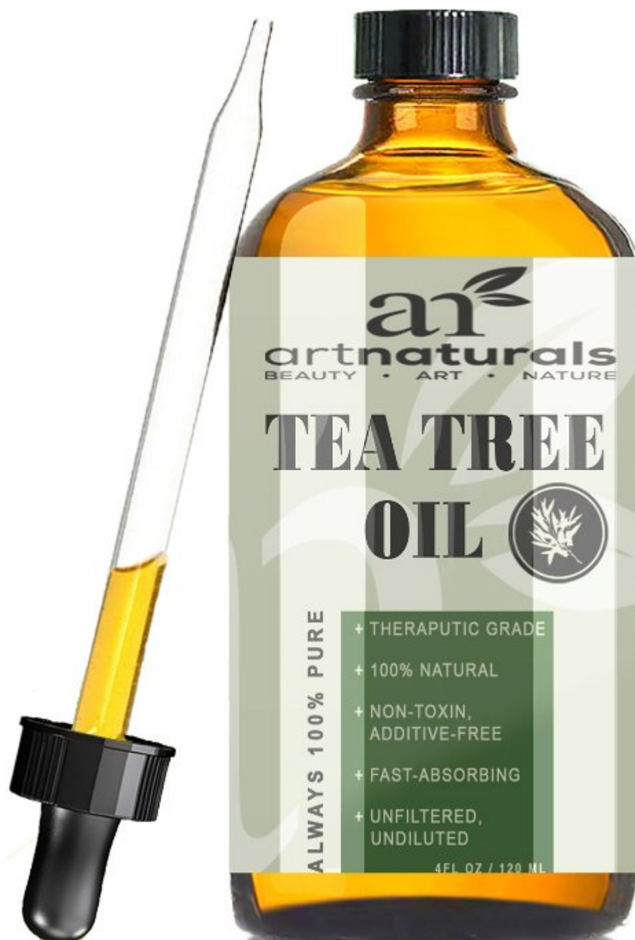
Art Naturals Tea Tree Essential Oil Pure