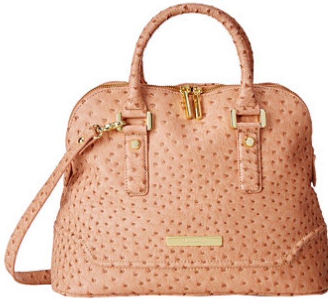
Ivanka Trump Ava Dome Satchel